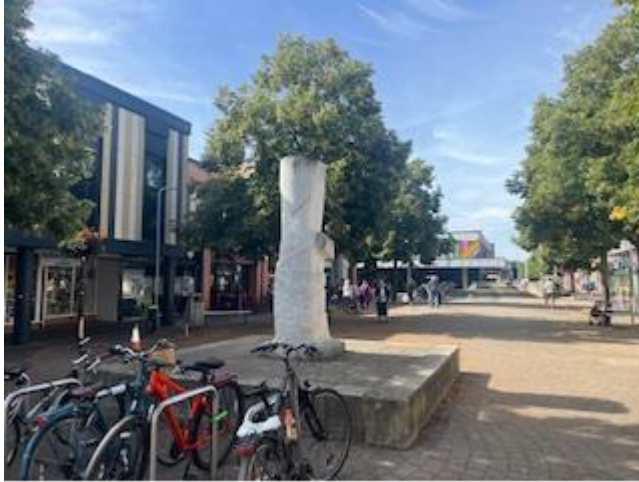
Photograph of sculpture within existing Beeston Square location.