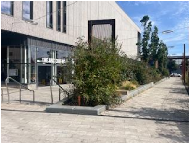
Photograph of proposed location for the sculpture, within existing planter – to the front of Arc Cinema.