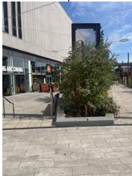
Photograph of proposed location.