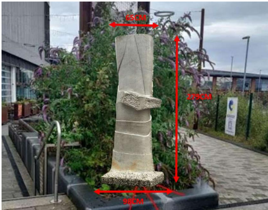
Photograph to show mock-up image of sculpture in new location.