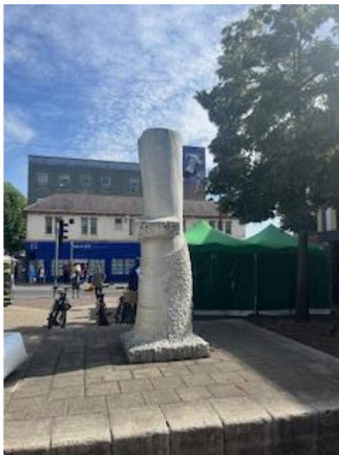
Photo of sculpture as existing from the south.