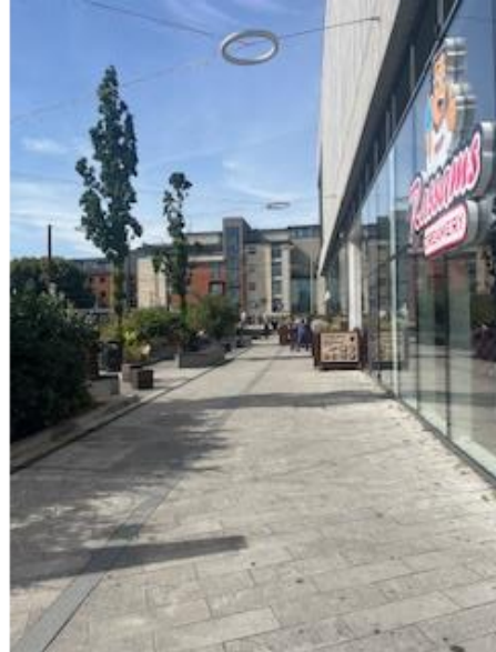
Photo of walk up to the new site.