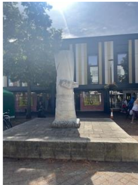
Photograph of sculpture in existing location from the west.